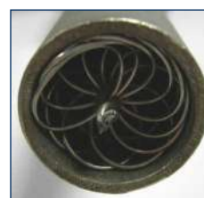
Fig 3 Internal Fluid Turbulator