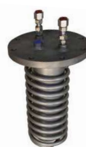
Fig 7 AES682C™ Internal

Shell Side Maximum Rated Operating Temperature: 80°C (176°F)