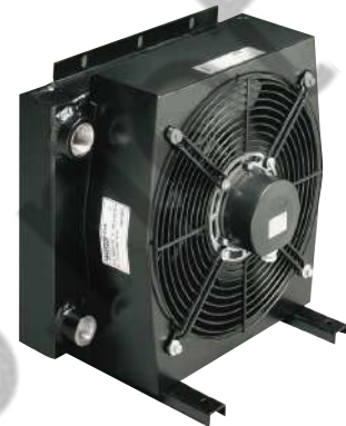
Fig 5 Air blast cooler

ATEX Compliant: Zone 1 Anti-static Exd motor available