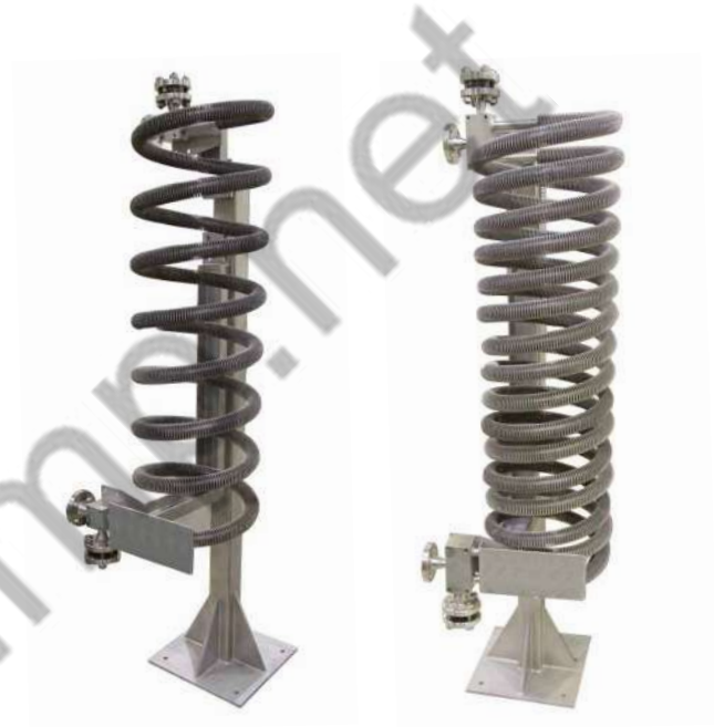
Fig 1 Single Coil

Maximum Rated Operating Temperature: 200°C (392°F)