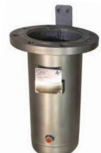
Fig 8 AES682C™ Shell