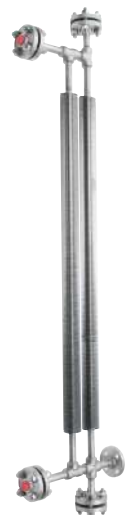
Fig 4 Finned Radiator Cooler